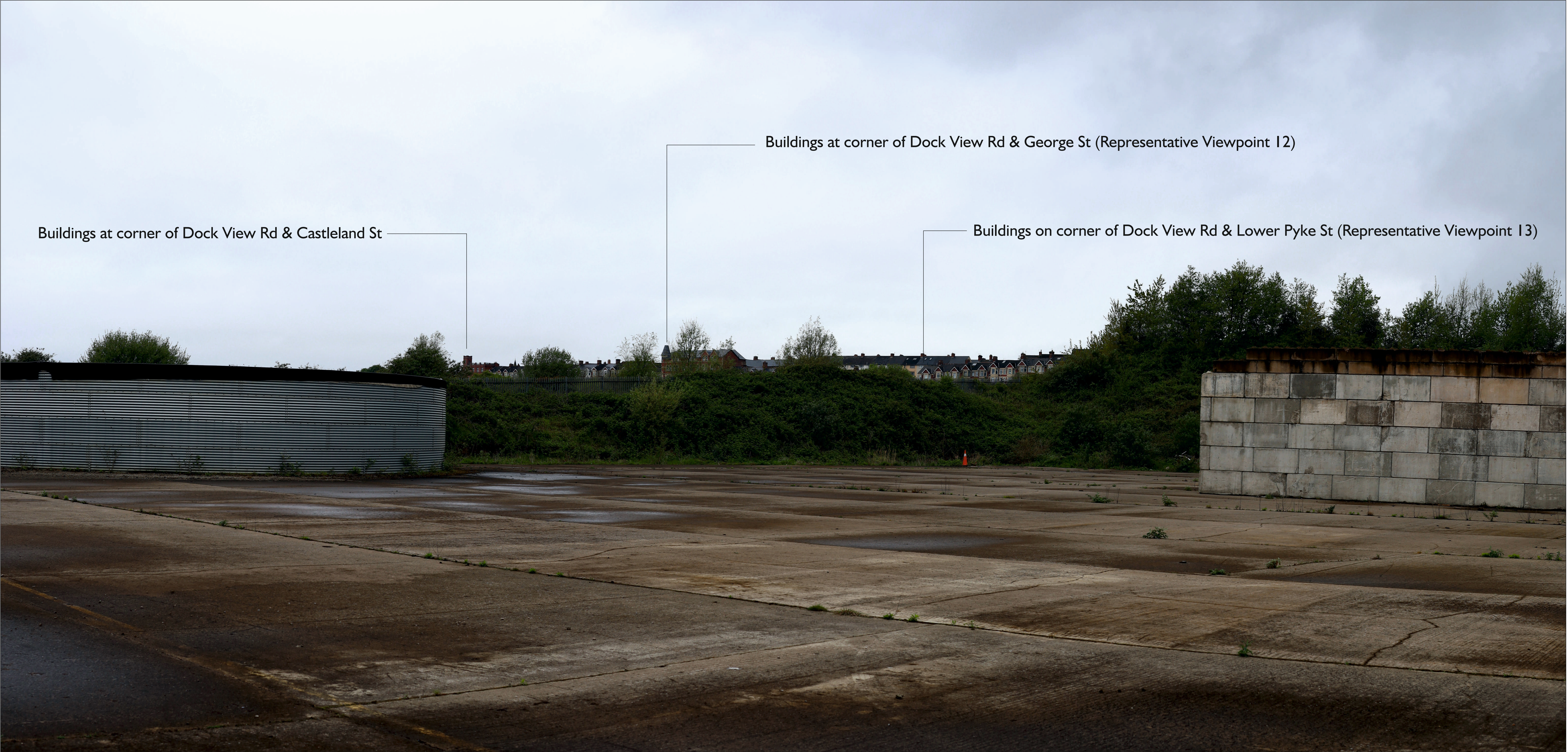
Illustrative Viewpoint 2 - Looking northwest from the southwest end of the Site